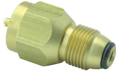
MacCoupler adaptor (from website)